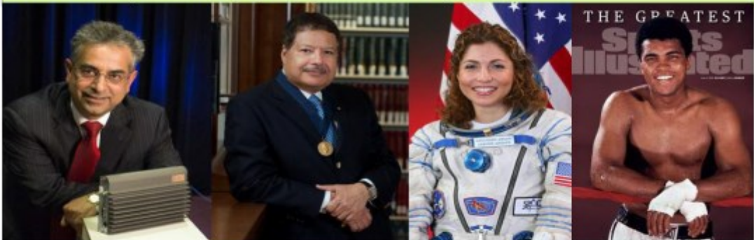
Inventor of cable modem-R. Yassini